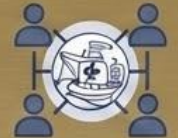
Employer Pension/ Provident Fund (occupational structure)