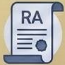
RA Fund A (individual contract)