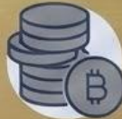
RA Fund B